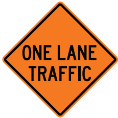
WD-106 ONE LANE TRAFFIC