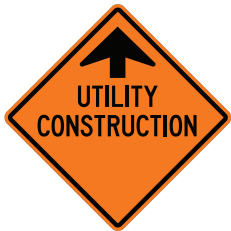
WD-101C UTILITY CONSTRUCTION