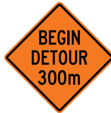
WD-102 BEGIN DETOUR 300m