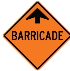
WD-104 BARRICADE AHEAD