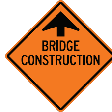
WD-101B BRIDGE CONSTRUCTION AHEAD