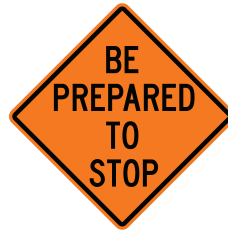
WD-111 BE PREPARED TO STOP