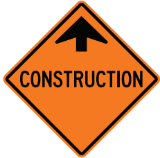
WD-101 CONSTRUCTION AHEAD